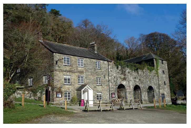
Cotehele Quay: 'The Edgcumbe', dating from the late 18th/early 19th century, with attached limekilns and warehouse