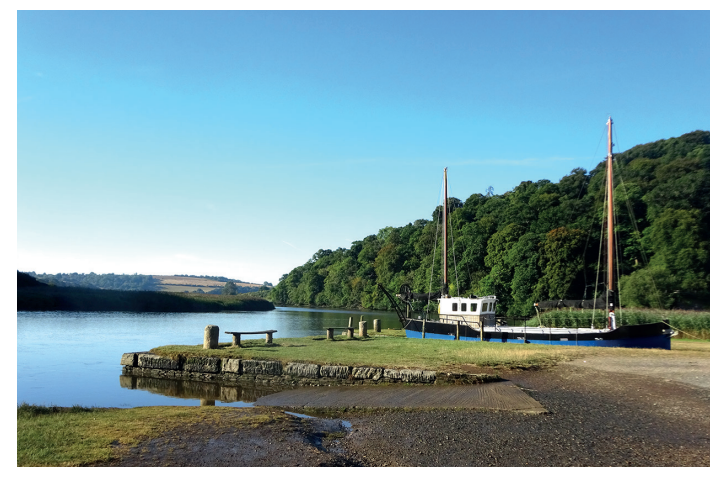
The tranquil River Tamar at Cotehele Quay on a hot summer morning