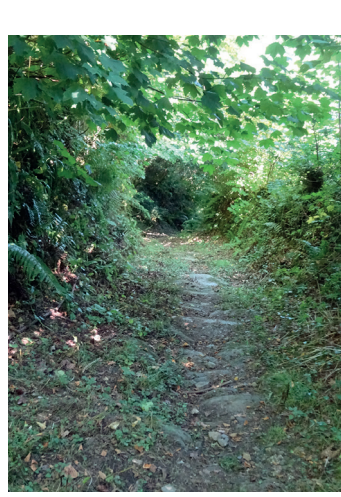
'Mill Turning': a longestablished route to Cotehele Mill