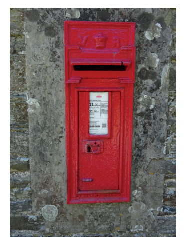
'VR' postbox in Bohetherick