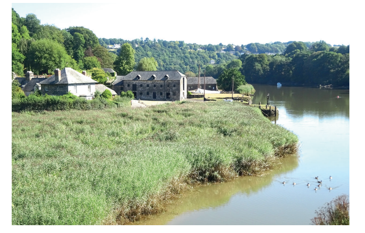
View across the Etherick Lake to Cotehele Quay