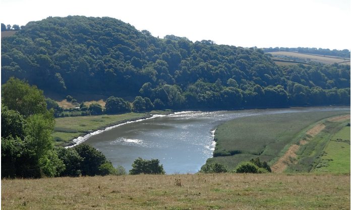
The River Tamar from East Down