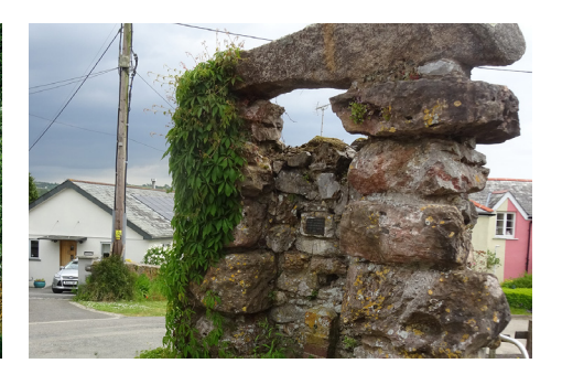
Bere Ferrers' impressive town well