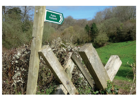
A ladder stile crosses the hedgebank at the start of Point 2