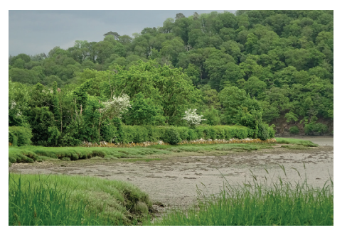
View across the estuary from Gnatham