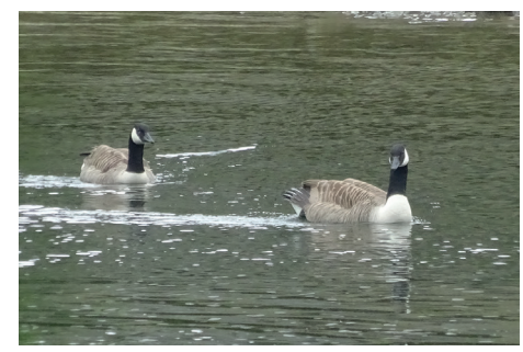
Canada geese at Lopwell Dam