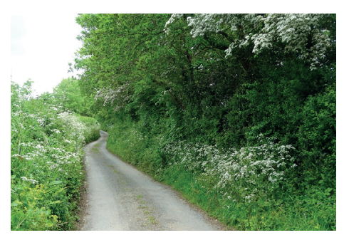
Hawthorn and cow parsley on the lane to Lopwell Dam