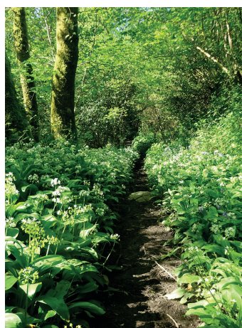
The path through Buttspill Wood in May