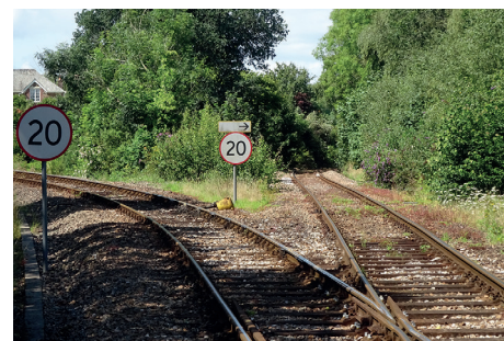
The two railway tracks at Bere Alston Station: Plymouth left, Calstock (and Gunnislake) right