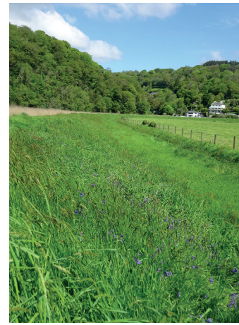
Looking back along the embankment path