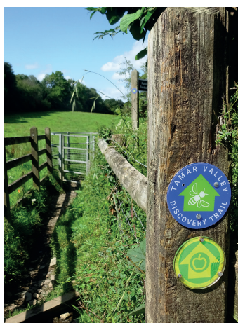
The Tamar Valley Discovery Trail is followed for two thirds of the route

7. Footpath back to station (SX 433 673). Just before the lane starts to ascend again turn left through a metal gate (footpath sign on a telegraph post on the right of the lane). Follow the field-edge path ahead to pass under the railway line (Gunnislake line) and through a gate into a field, to find a path junction. Keep straight on across the field, aiming for a couple of houses – the telecommunications mast on North Hessary Tor at Princetown on Dartmoor can be seen in the far distance – and pass through a kissing gate on the far side (re-joining the TVDT) onto a track. Turn right; pass under two railway bridges (the line to Gunnislake, and then Plymouth), then turn left to find the station.