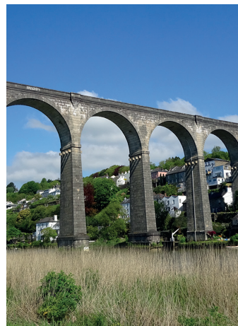
The lofty Calstock Viaduct