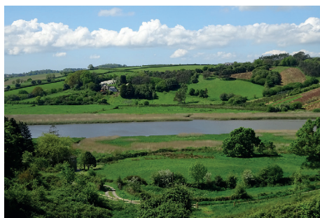
View across the river from the track leading to Ward Mine and South Ward Farm