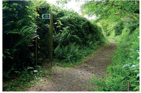
The footpath crosses a track near Rumleigh