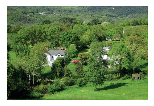
View across old market garden fields towards the Tamar Valley

Keep straight on to meet a track on a bend; keep ahead again, passing houses, eventually turning sharp right to find the station, which opened in 1890 and was important for the onward transport of local market garden produce into the early 20th century.