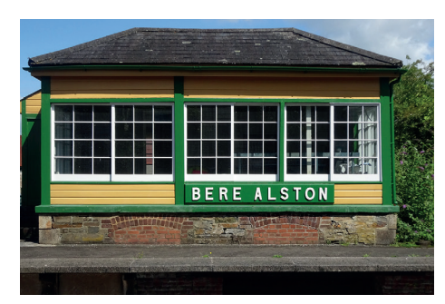
The old signal box at Bere Alston Station