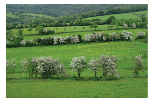
Hawthorn hedgerows at Slymeford