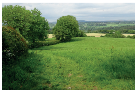
Looking back towards the Tavy valley on Point 7