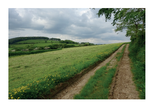
Lovely field-edge path on Point 6