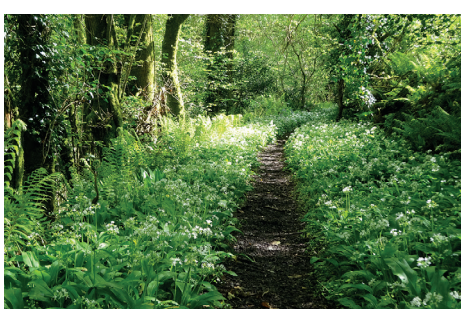
Wild garlic flanks the path through Butspill Wood