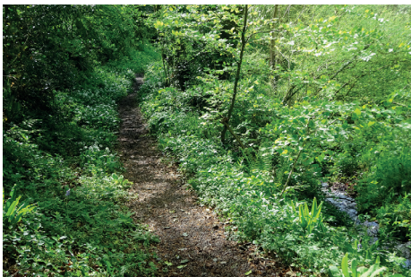
The brookside path is glorious in springtime