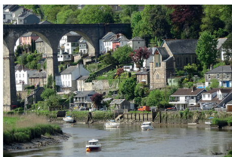
View towards Calstock and the magnificent railway viaduct