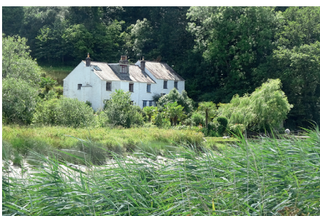
Cottages at Tuckermarsh Quay, seen from the Calstock floodbank