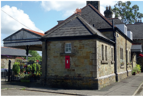
Bere Alston Station

Turn right; pass under two railway bridges (the line to Gunnislake, and then Plymouth), then turn left to return to the station.