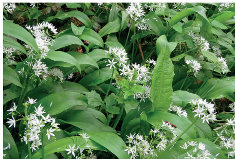
Wild garlic, also known as ramsons