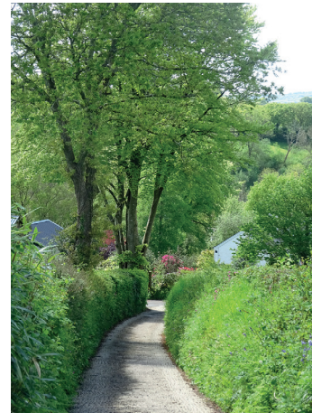
Follow the footpath track down through old daffodil fields