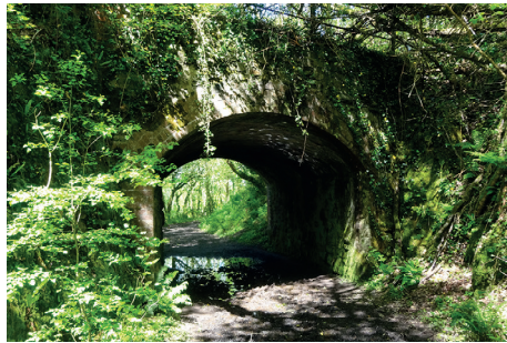
The bridleway passes under the old railway line to Tavistock