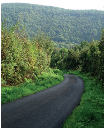
Stony Lane: a steep descent into the valley

Turn left; at the Coop turn right down Glendorgal Park to find a narrow tarmac footpath on the right that follows garden fences to meet a track. Bear left to pass under the railway and meet Well Park Road. Turn left, and left again for the station.