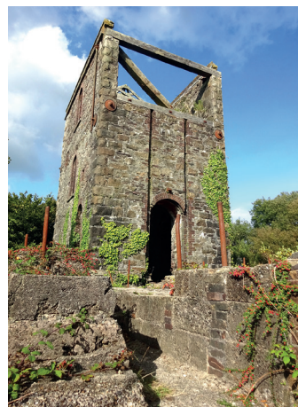
Hingston Down Mine engine house