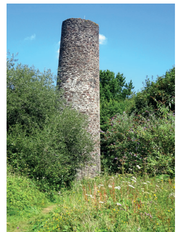
Chimney, Drakewalls Mine