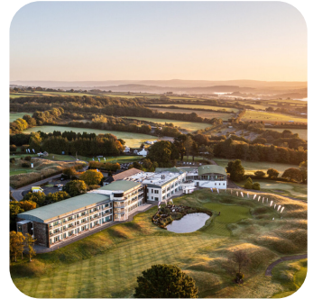
St Mellion International Resort