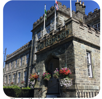
The Bedford Hotel,