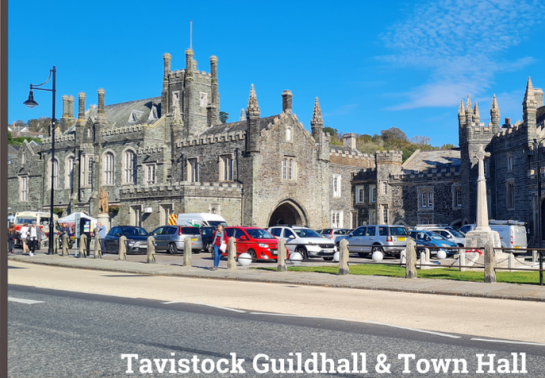
Tavistock Guildhall & Town Hall