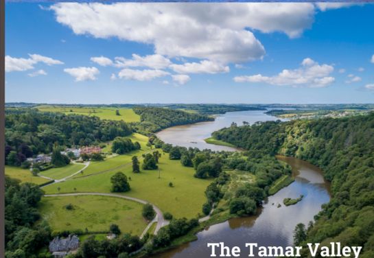
The Tamar Valley