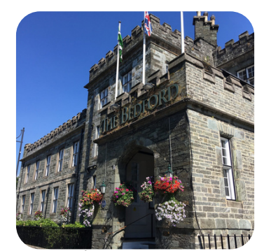
The Bedford Hotel,