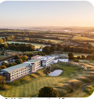
t Mellion International Resort