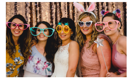
A\ collation\ of\ images\ from\ our\ recommended\ photographers