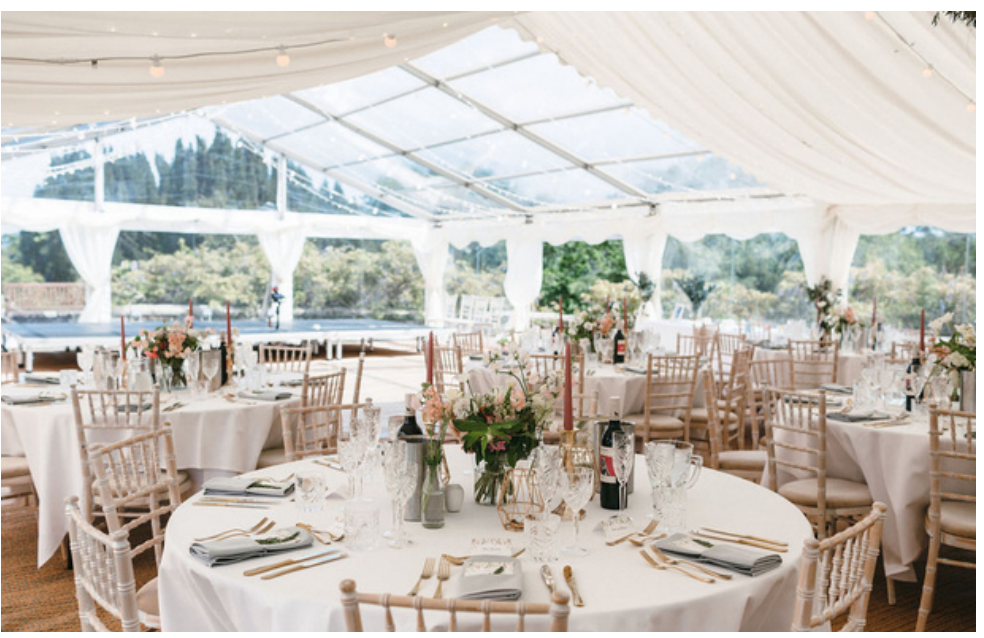
Emily & Rich's sustainable outdoor wedding