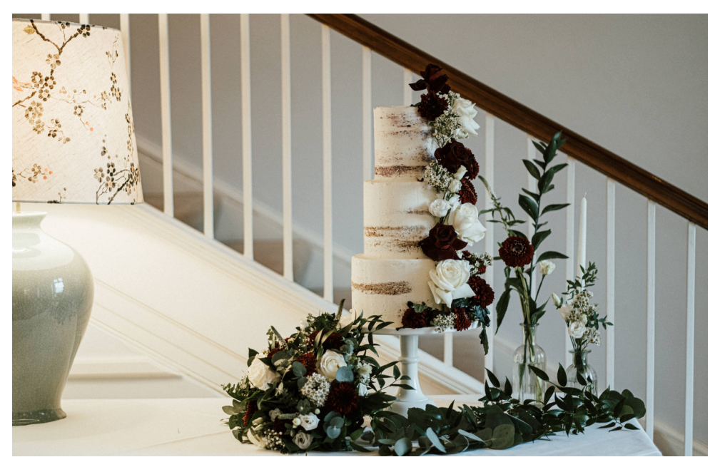
Donna & Ryan's autumnal wedding