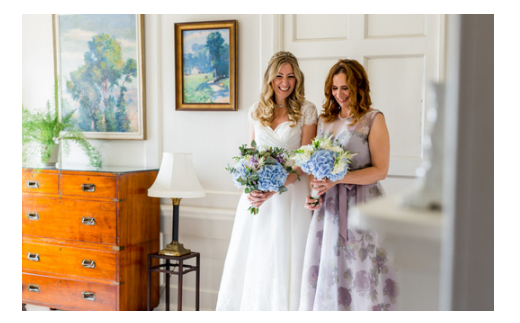
A\ collation\ of\ images\ from\ our\ recommended\ photographers