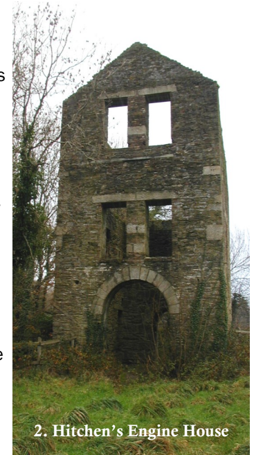
2. Hitchen's Engine House

❾ The boiler house ❿ is to the north of the main engine house and the boiler house chimney is at the west end. Now turn right and head towards the gate walking on level ground. Look to your right and you will see the remains of two reservoir ponds which served the steam engines.