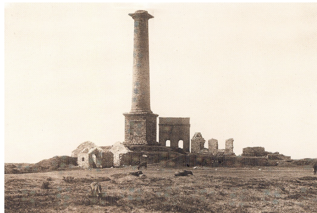
Kit Hill in 1908

There is a horse trail on Kit Hill, but there are no cycle routes in the country park other than the access track to the top.